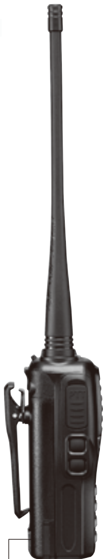
shown with EBP-87

5 : Dust protected /Ingress of dust is not entirely prevented, but it must not enter in sufficient quantity to interfere with the satisfactory operation of the equipment; complete protection against contact 4: Splashing water / Water splashing against the enclosure from any direction shall have no harmful effect. Test duration: 5 minutes / Water volume: 10 litres per minute /Pressure: 80-100 kN/m 2