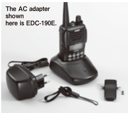
Shown with standard accessories